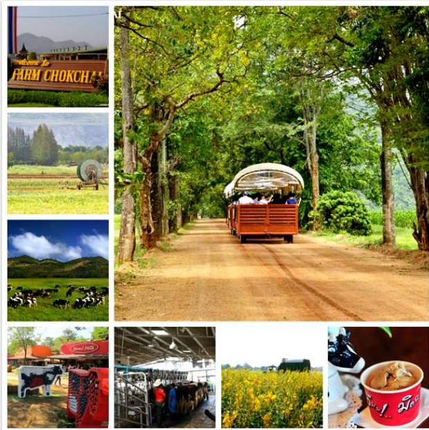
Chok Chai Farm