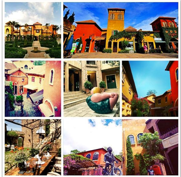
Palio Khao Yai